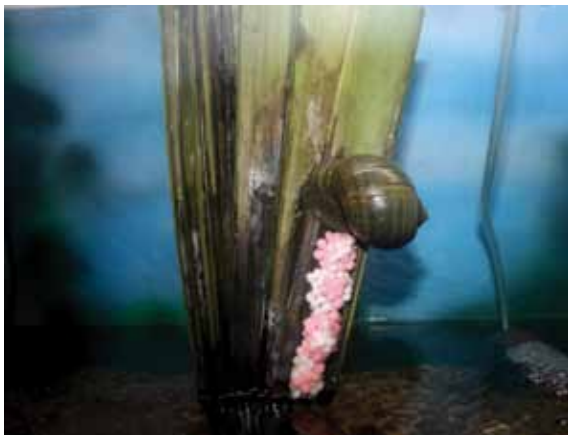
Island apple snail