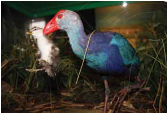
Purple swamp hen

In addition to live examples of harmful alien species, the Alien Attack exhibit presents vivid photographs of invasive species that might be found in your own backyard, along with recommendations on what can be done to resist the invasion. A few plant examples common in southwest Georgia are Chinese privet, coral ardisia, nandina and Japanese climbing fern.